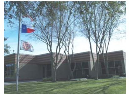
All schools are located at 1625 Staffordshire Road Stafford, Texas 77477

In 1976, Stafford residents voted to create a break-away school district, one that would offer a small school environment for their children. Over two decades later, that tiny school district has grown to a student population of over 3100 with a focus on small classes and academics. At the start of the 2003-04 school year, SMSD opened its doors to students outside its boundaries. The school board adopted policy to allow tuition-free enrollment for qualifying students. While maintaining a small-school personality and a low teacher to student ratio, SMSD is available for more families to become a part of the school district. The tiny district that started classes in a warehouse has grown to a successful 96-acre, six-campus school district with outstanding student success. Stafford Municipal School District . . . Where Children Are Important.