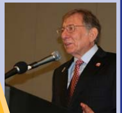
Mayor Leonard Scarcella

2nd Annual Teacher Appreciation Gala September 6, 2008 Stafford Centre