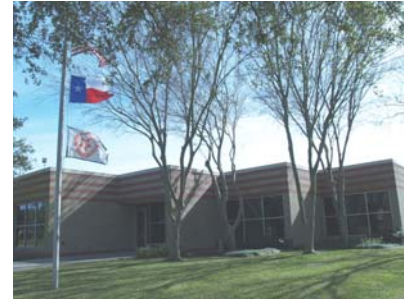
All schools are located at 1625 Staffordshire Road Stafford, Texas 77477

In 1976, Stafford residents voted to create a break-away school district, one that would offer a small school environment for their children. Twenty-five years later, that tiny school district has grown to a student population of over 2800 with a focus on small classes and emphasis on academics. At the start of the 2003-04 school year, SMSD opened its doors to students outside its boundaries. The school board adopted policy to allow limited open enrollment for qualifying students. While maintaining a small-school personality and a low teacher to student ratio, SMSD is available for more families to become a part of school district. The tiny district that started classes in a warehouse has grown to a successful 96-acre, six-campus school district with outstanding student success. Stafford Municipal School District . . . . Where Children Are Important.