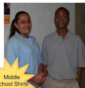
Middle School Shirts

Approved at the May 12, 2008, school board meeting, beginning in August Stafford Middle School students will wear shirts that correspond to their grade levels. Seventh Graders will wear gray shirts and Eighth Graders will wear light blue shirts. The Campus Improvement Team and the faculty researched dress codes in surrounding districts before proposing a change to the board.